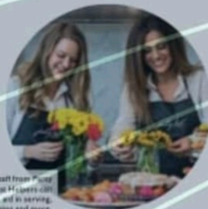
Staff from Party Host Helpers will be in serving, arranging and more.